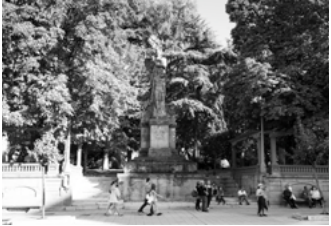
Rúa do Paseo