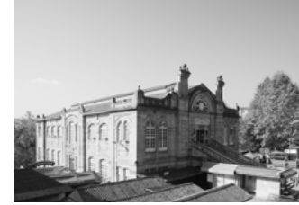
E Praza de abastos y rianxo