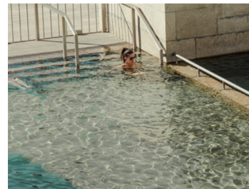
FACING As Burgas ABOVE Enjoying in the public thermal pool

also used by traders at the food market who made use of the fountains to pluck poultry after dipping them in the hot water. Nowadays, it is common to see locals filling up water bottles to take advantage of the healing properties of the water, which is especially useful for skin conditions.