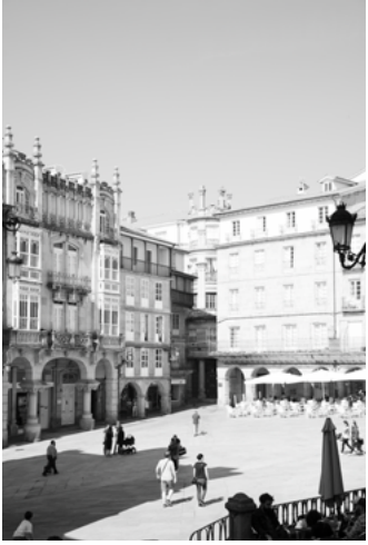
A Praza Maior