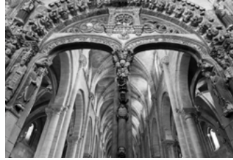
C Catedral Basílica de San Martiño