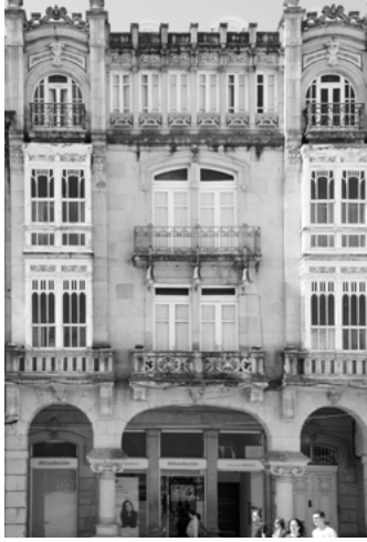
B Casa de Fermin García