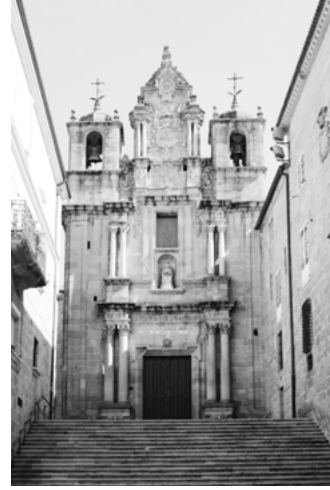
D Igreja de Santa Maria Nai